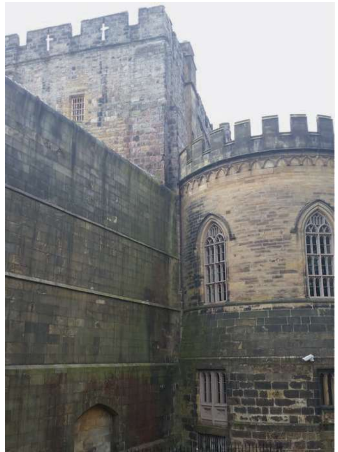
Figure 2: Area on the northern side of Lancaster castle where executions took place between 1800 and 1865. A hinged stone at ground level allowed the criminal's corpse to be taken inside the Castle after the execution. 13

Four months later, on January 15th 1827, two new rules were proposed and unanimously accepted at a Book Club meeting; firstly, that the annual subscription for members be increased from half a guinea to one guinea and secondly, that 'all expenses which may hereafter be incurred in conducting the dissection of executed criminals be defrayed from the funds of the society by the Treasurer'. Although the Minute Book does not record who proposed these new rules, Mr. Smith was the only surgeon present and, as Secretary-Treasurer, it seems almost certain that they can be attributed to him.