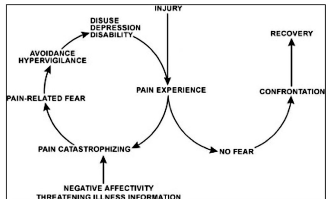
Fear Avoidance Model 7

showcases how painful experiences are catastrophised, causing fear towards them to build up. This leads to avoidance and disability. This can be further aggravated by negative affectivity, such as negative emotions and external influences that increase the fear towards an experience. 7